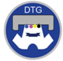
DIGITAL TEXTILE PRINTING (DTG)