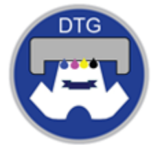
DIGITAL TEXTILE PRINTING (DTG)