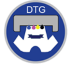
DIGITAL TEXTILE PRINTING (DTG)